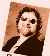
Chas Hodges Rock-n-Roll Trio (Sunday)