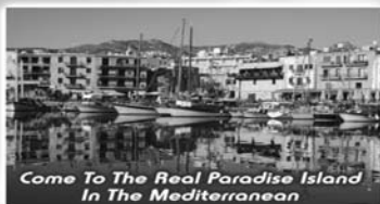
Come To The Real Paradise Island In The Mediterranean

★ IDEAL RETIREMENT DESTINATION. SUPERB INVESTMENT OPPORTUNITY. ★