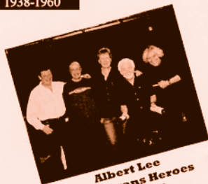
Albert Lee and Hogans Heroes (Saturday)