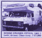
DODGE CRUISER PETROL 1981 6 berth, shower, clean body. £17,500