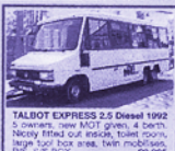
TALBOT EXPRESS 2.5 Diesel 1992 5 owners, new MOT given, 4 berth, Newly fitted out inside, toilet room, large fuel box area, twin mobilise, P.P.S. 60L £2,995

1991 CITROEN C25 COACHBUILT Long long wheelbase, 6 berth, diesel, shower room, solar panel, nearly new upholstery, Wood awning, bike rack..... £10,495 1984 FIAT DUCATO 5 berth, petrol, 1971cc, B/shower room, sleep over the cab, bike rack, lots of space inside, new MOT given..... £6,250 BEDFORD CF LWB Coachbuilt body, long wheel base, 6 berth, diesel, awning, shower room; lots of space, drive away, needs some work, grab a bargain..... £2,999 1985 HONDA ACTY 2 1/2 berth, low road tax, big windows inside, double glazed, 76,000 miles, new MOT given..... £2,395 1984 RENAULT TRAFIC AUTOSLEEPER POPTOP 4 berth, lovely interior, awaiting preparation..... POA