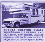
TOYOTA DOLPHIN SMALL WINNEAGO 2.2 PETROL LHD MOT given, new carpets, updated contents, 4th berth, new colour & fridge, air con. Lots of space £5,660