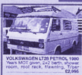
VOLKSWAGEN LT25 PETROL 1980 Years MOT given, 2+2 berth, shower room, roof rack, Tawing, Traxer £2,955