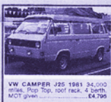
VW CAMPER J75 1981 34,000 miles, Pop Top, roof rack, 4 berth, MOT given £4,795