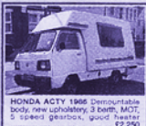
HONDA ACTY 1986 Demolition body, new upholstery, 3 berth, MOT, 5 speed gearbox, good heater £2,250