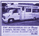
FIAT AUTOCIRURUS 2.5 Ltr Diesel 3 berths, 69,000 miles, Long MOT, 2 berth, shower, Excellent storage £9,365