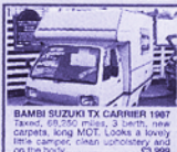
BAMBI SUZUKI TX CARRIER 1987 Tawed, 69,250 miles, 3 berth, new carpets, long MOT, Looks a lovely little camper, clean upholstery and on the body £5,999