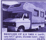
BEDFORD CF 2.3 1983 4 berth, new MOT given, shower room, sleep upholstery £2,275