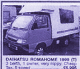
DAIHATSU ROMAHOME 1989 (T) 3 berth, 1 owner, very nippy 2nd reg, Tax, 5 speed £5,995